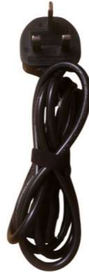
Mains Lead Connects to Adapter