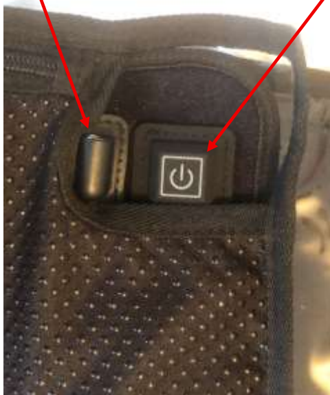
Power Button & Selector