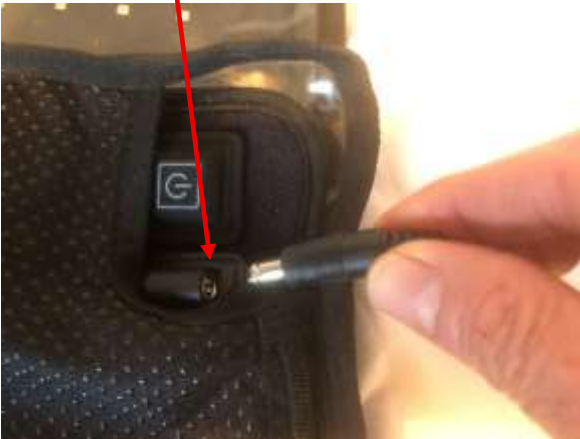
Connect Mains Cable